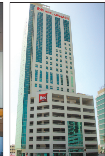
READY FOR BUSINESS: From left, a 'designer bedroom', a view of the lobby and an outside view of the hotel

traditional dishes that accommodate the flavours of the region, including biriyani, shawarma, fattoush, hammour and a 'Seef salad', described as the ultimate healthy option.