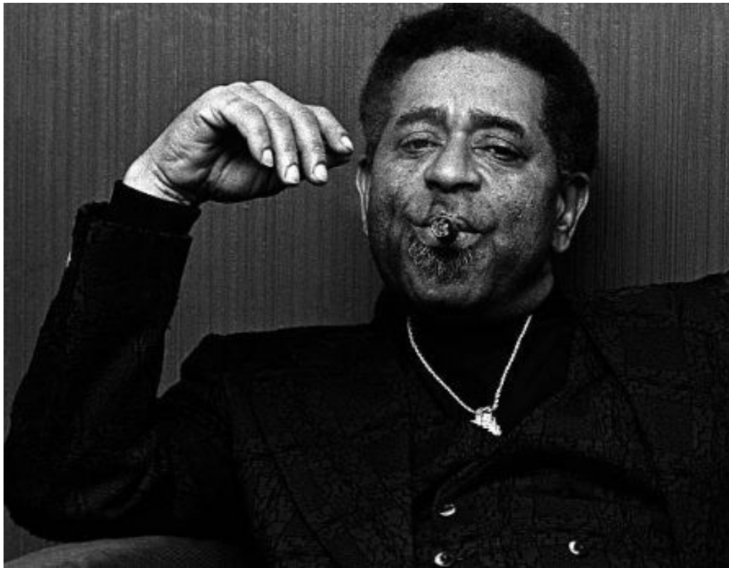
Dizzy Gillespie ( 1960)

Black Culture - Cannabis has been part of our culture since the 1920s-30s during the Jazz era. This is a story of cannabis. It is the story of deeply entrenched elements of culture demonized and disparaged yet unable to be uprooted. It's no wonder their stories are intertwined in ways that go far deeper than their connections to the creative world. Cannabis gives us a unique creative vibe when we as an artist trying to create something meaningful with our work. Well-known artists such as Billie Holiday, James Baldwin, Snoop Dog, Cab Calloway, Louis Armstrong and many use cannabis to help them to be more creative with their mastermind of work.