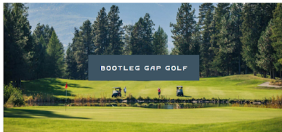
BOOTLEG GAP GOLF

Tucked into the banks of the St. Mary River, the course at Bootleg Gap features isolated, tree-lined holes and stunning views from every tee.