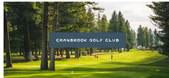
CRANBROOK GOLF CLUB

Tucked into the banks of the St. Mary River, the course at Bootleg Gap features isolated, tree-lined holes and stunning views from every tee.