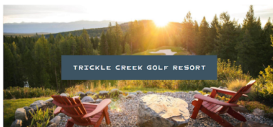
TRICKLE CREEK GOLF RESORT

Cleverly designed and surrounded by mountain vistas, there are few golf courses in Canada that offer such beauty, excitement and playability.