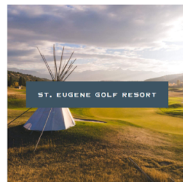
ST. EUGENE GOLF RESORT

Each hole provides challenging and rewarding golf, and strategic tee placement has ensured breathtaking views from every drive.