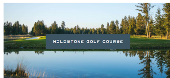
WILDSTONE GOLF COURSE

From the first drive to the last, golfers are challenged by changing elevations, deep ravines and narrow fairways. And the rewards are provided at every viewpoint.