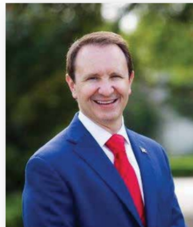
Jeff Landry Louisiana Attorney General