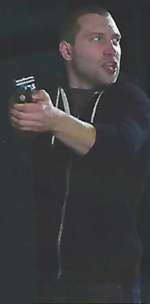
JOHN MCCLANE Junior, a.k.a. "Jack," is played by newcomer Jai Courtney.

"He thinks his kid is a screw-up," 20 th Century Fox CEO Tom Rothman explains. "But, in fact, it's the opposite. The kid is more like the father than the father thinks. So it's