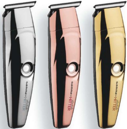
Gamma+ Absolute Hitter Trimmer @gammaplusna > Available in silver, rose gold and gold, this new trimmer features a fully adjustable, unique zero-gap black diamond carbon DLC blade made with crushed diamonds.