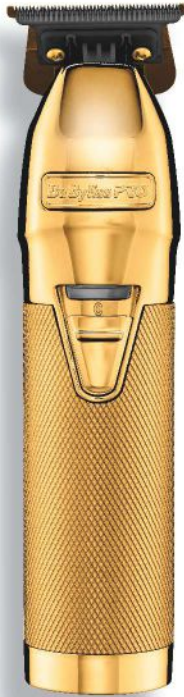
BaBylissPRO GoldFX @babylissprousa > Featuring a high-torque, brushless Ferrari-designed 7200 RPM engine, the lithium outliner boasts a two-hour run time and all-metal housing.

Be armed for any style your client requests with this selection of tools.