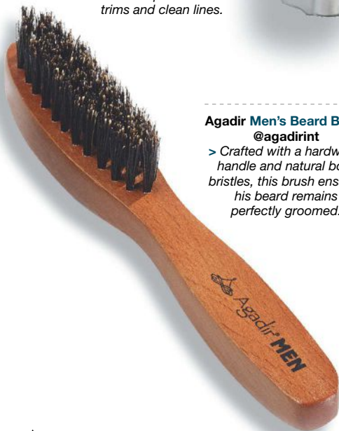
Agadir Men's Beard Brush @agadirint > Crafted with a hardwood handle and natural boar bristles, this brush ensures his beard remains perfectly groomed.