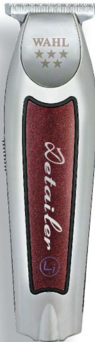
WAHL Professional Cordless Detailer Li @wahlpro > With the same look and feel as the original Detailer, the Li features a swivel cord for charging ease and a faster T-wide blade perfect for close trims and clean lines.