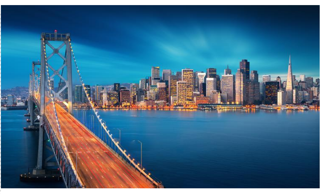
San Francisco Neighborhoods That Are More Affordable