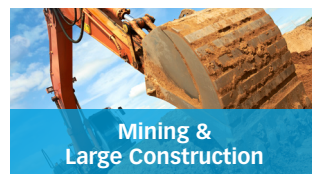
Mining & Large Construction