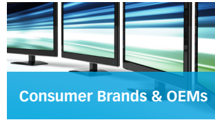
Consumer Brands & OEMs