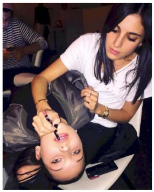
Instagram | @bellahadid

Hmm, seems questionable, but in a revealing Instagram <u>pic</u>, the model claims that it results in a more natural finish.