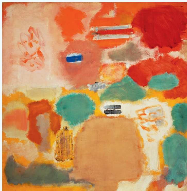
Clockwise from left: No. 21 (1947) by Mark Rothko; the artist is known for his floating blocks of colour painted in the 1940s and 50s; Florence's central Duomo