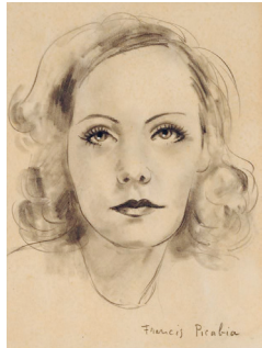
Above: Claridge's ArtSpace; Francis Picabia's portrait of Greta Garbo

If you're in the mood for avant-garde and modern masters, look no further. This gallery regularly offers works by Sigmar Polke, Georg Baselitz, Marcel Broodthaers and Piero Manzoni. Head over to Women: Works on Paper 1902-1950 : an exhibition spanning 50 years of Francis Picabia's exhilarating career. michaelwerner.com