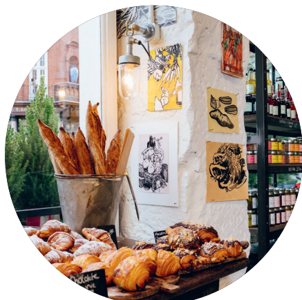
From top: Albert Oehlen Untitled, 2024 at Gagosian; Ewan Venters' Farm Shop; The Cocochine

HOW TO DISCOVER ARTISTIC INSPIRATION IN THE HEART OF LONDON, BY MAÏA MORGENSZTERN