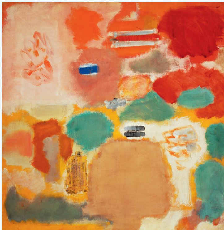
Clockwise from left: No. 21 (1947) by Mark Rothko; the artist is known for his floating blocks of colour painted in the 1940s and 50s; Florence's central Duomo