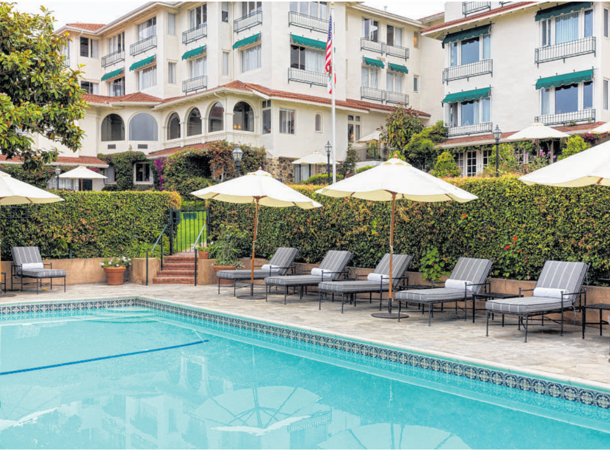
La Playa Carmel, a historic boutique hotel, exudes charm with its cosy rooms, period features, and breathtaking sea views; below, Chez Noir in Carmel is a Michelin-starred gem, serving seafood-centric delights.

Planning a road trip can be overwhelming, especially when it’s as extensive as California’s coastal Route 1. This is Joel Porter’s ultimate guide to tackling a mammoth journey, including best stops, driving times, hotel stops and places to eat.