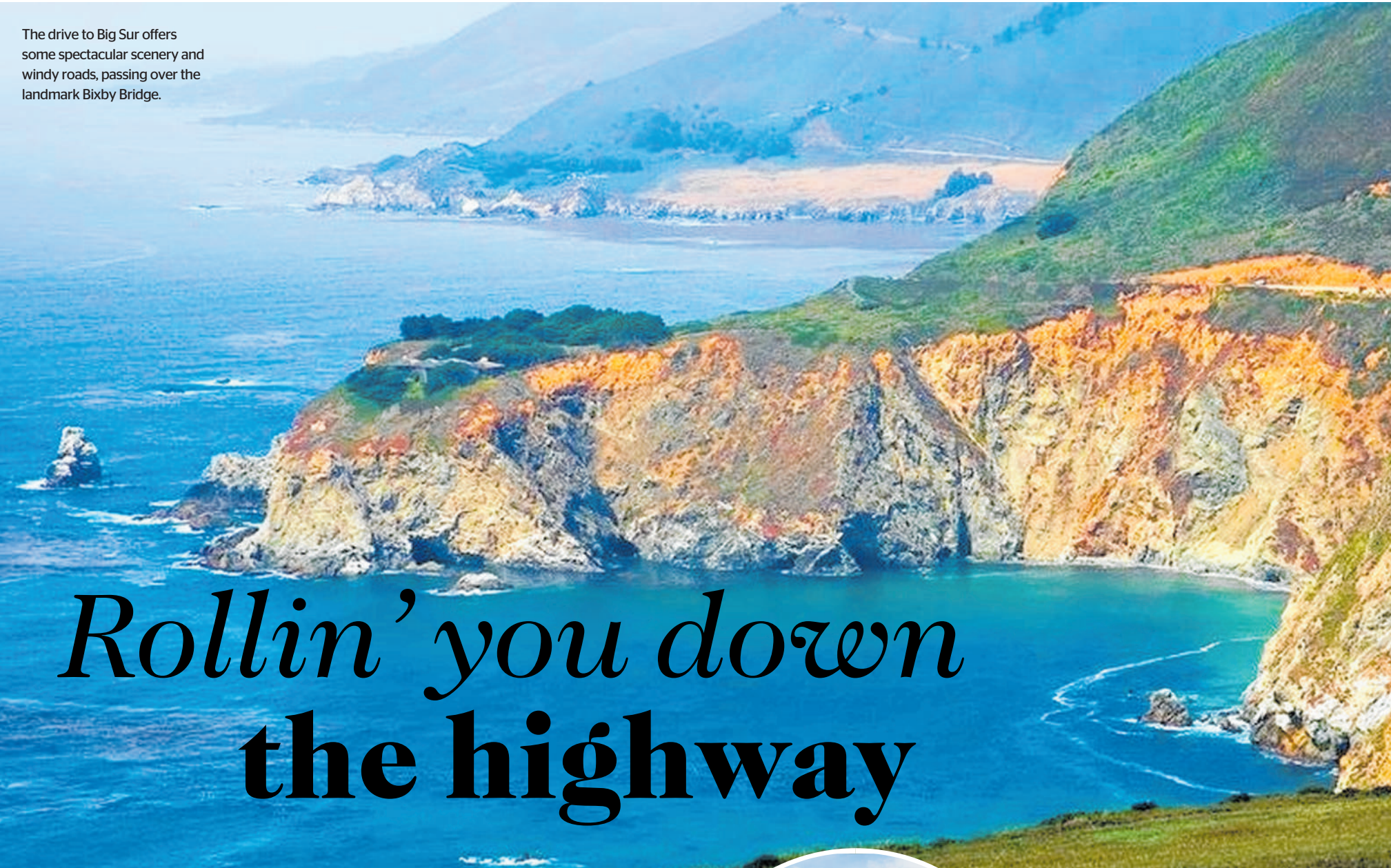
The drive to Big Sur offers some spectacular scenery and windy roads, passing over the landmark Bixby Bridge.