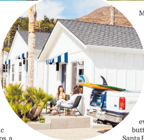
Once an old 50s roadside motor lodge, the Pacific Motel in Cayucos has had a stylish refurbishment.

Day 3 — Big Sur to Cayucos Heading south along the Big Sur coast, you'll be treated to 80km of unspoilt wild coastline so it's best to take it slow and admire the views at various points along the way. One of the best stops is Julia Pfeiffer Burns State Park, which has a lovely beach and hiking trails. Just before you reach San Simeon, pull over at Elephant Seal Point, where gigantic elephant seals bask on the beach in huge numbers, grunting and fighting for space on the sand. A bit further on, and the high, dramatic cliffs begin to wind down towards Cayucos, a quintessential chilled-out California beach town that draws relatively few tourists compared to nearby Cambria and Morro Bay. With a relaxed, local feel, the town comprises little more than a couple of surfshacks and restaurants and has barely changed in the 25 years since I first visited in 1999. One welcome new arrival is the Pacific