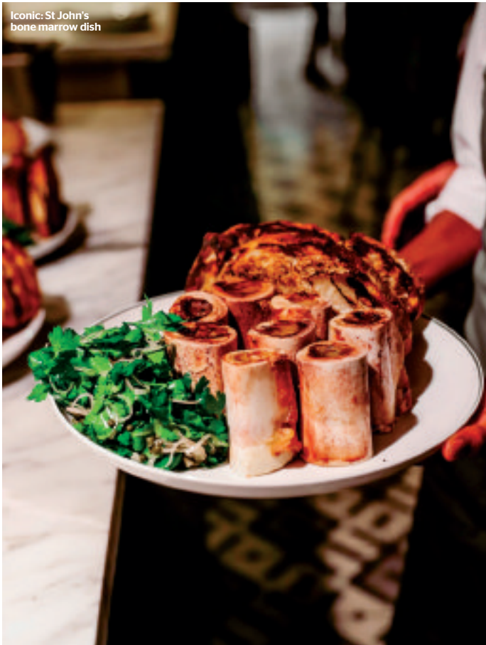
Iconic: St John's bone marrow dish