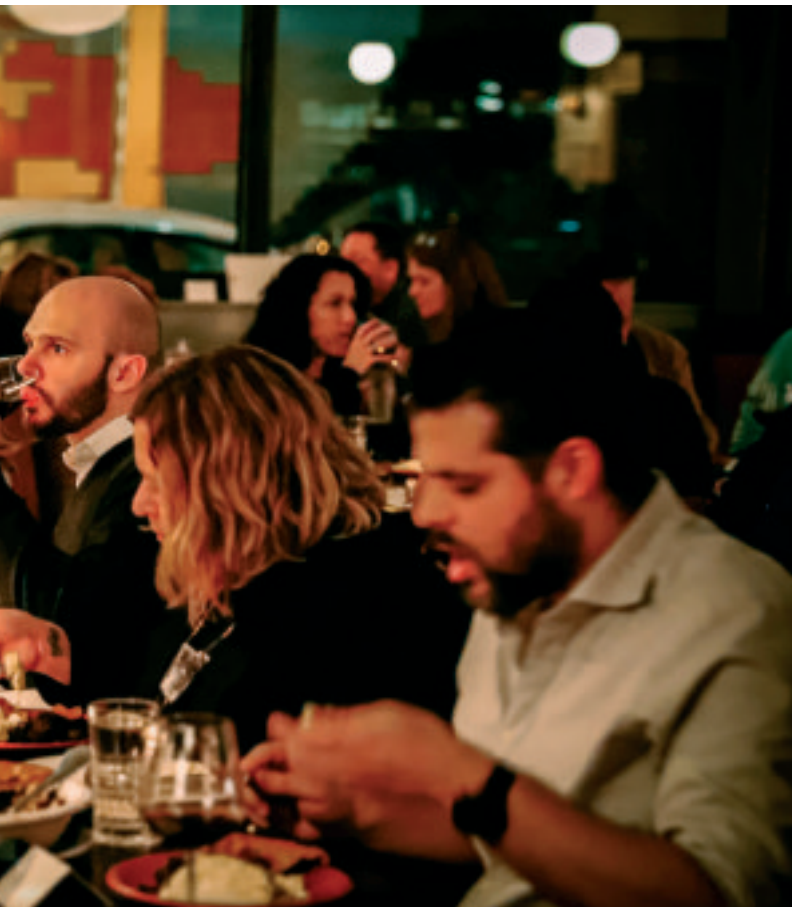
Using its brains: diners sampled classic St John dishes