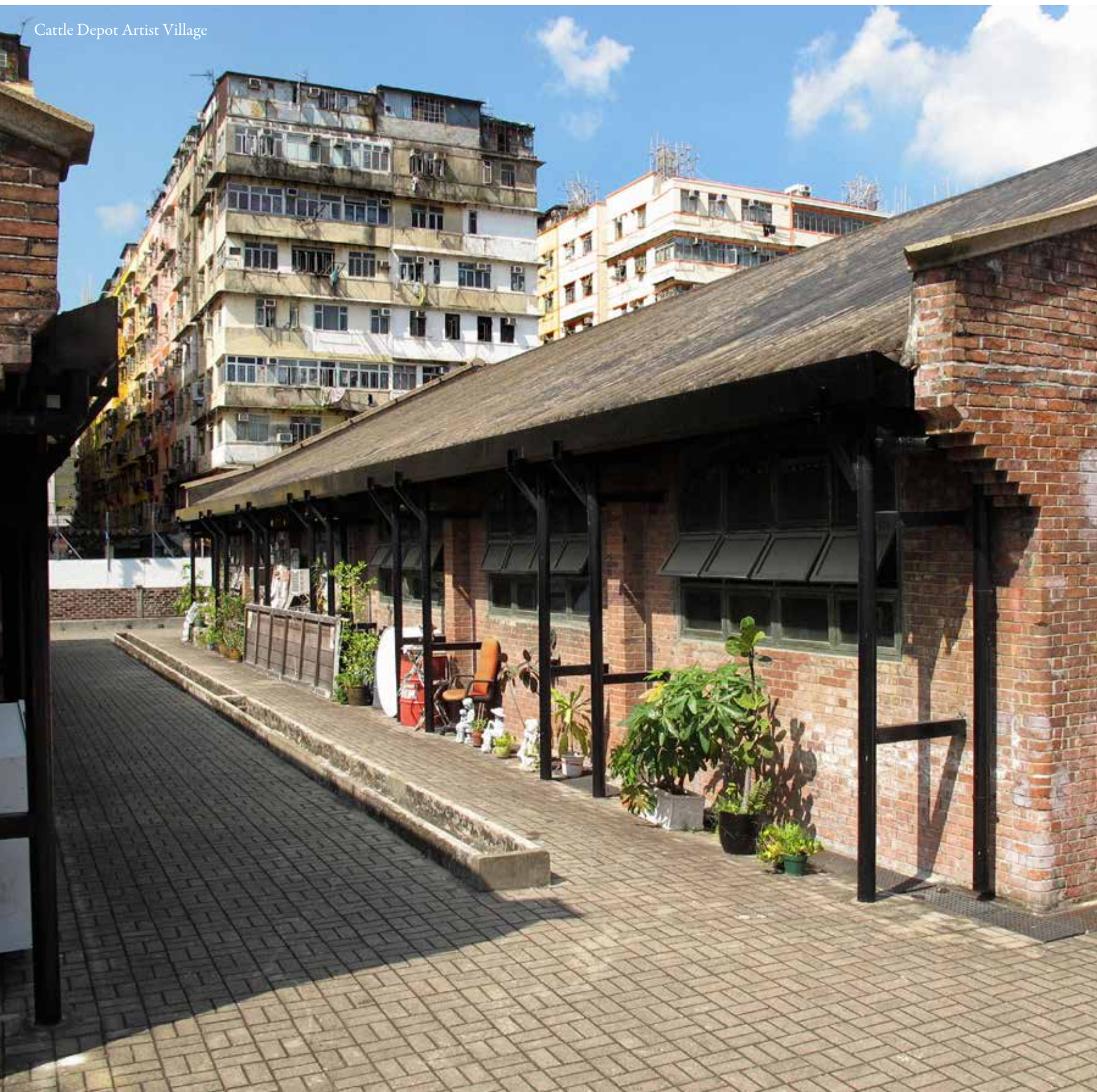
Cattle Depot Artist Village

63 Ma Tau Kok Road, To Kwa Wan, Kowloon City; +852 3509 7338