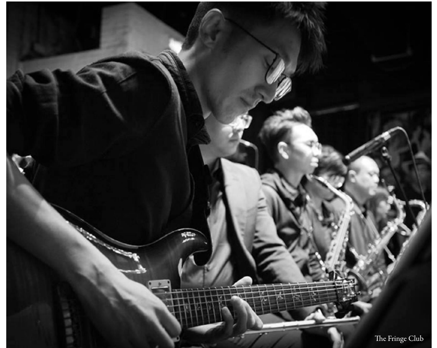
The Fringe Club