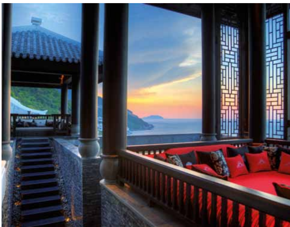
Text: Beverly Cheng