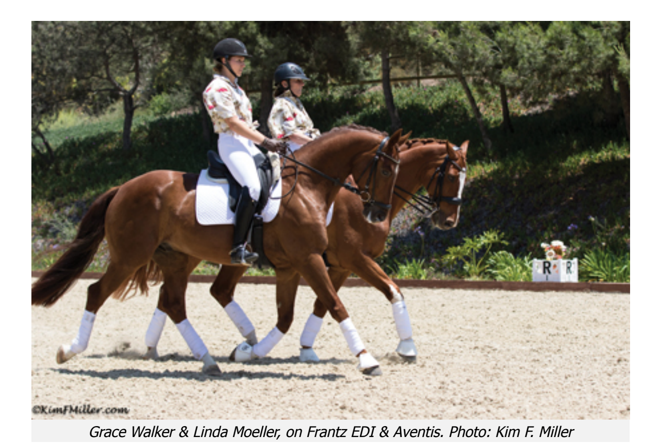
Arroyo Del Mar possesses a human-like tranquility that permeates from the horses, riders, and workers. It is this tranquility that calmed even the anxious newcomers that Saturday afternoon. I watched as strangers soon melded into the pockets of Arroyo riders, factions became one great sea of breeches and sun visors. The original curators of this tranquility were the Peters, who were found strolling and chatting after Steffen rode. I imagine the day's events were run as the Peters run every day. Nothing felt extreme, nothing felt rushed; there was a natural flow that moved people from one activity to the next.

The barn itself boasts 68 wood stalls with high beam ceilings and pristine (rubber-matted, but it looks like cobble stone) floors. The facilities are all built with an auburn-colored wood, which adds to the rustic and homey feel of Arroyo. Amenities including a horse-sized scale, Vitafloors, and a Solarium are found within the barn. Arroyo's most alluring feature is the miles of picturesque trails surrounding the barn. Every Wednesday, the Peters trail ride their horses with the intention of preserving their mental health and fighting spirits.