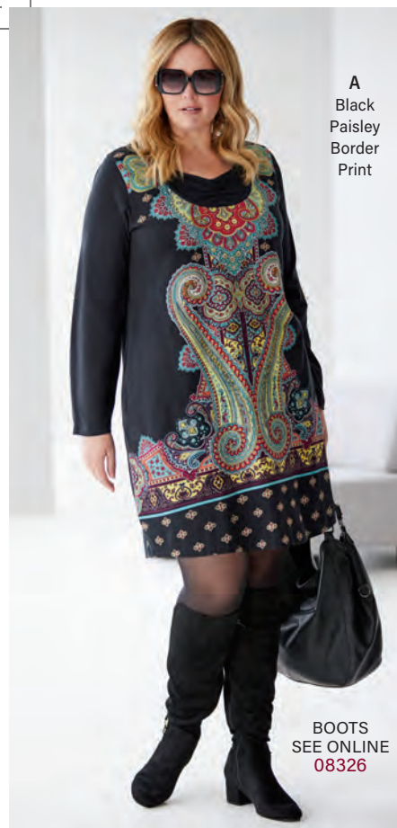
A Black Paisley Border Print