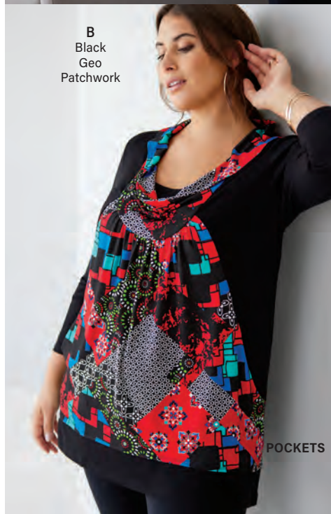
B Black Geo Patchwork