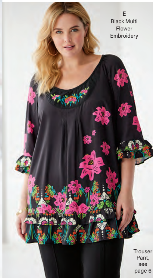
E Black Multi Flower Embroidery

hello modern vintage, paisley prints, shearling trims, bell bottom jeans. It all feels oh-so fun, feminine and fashionable.