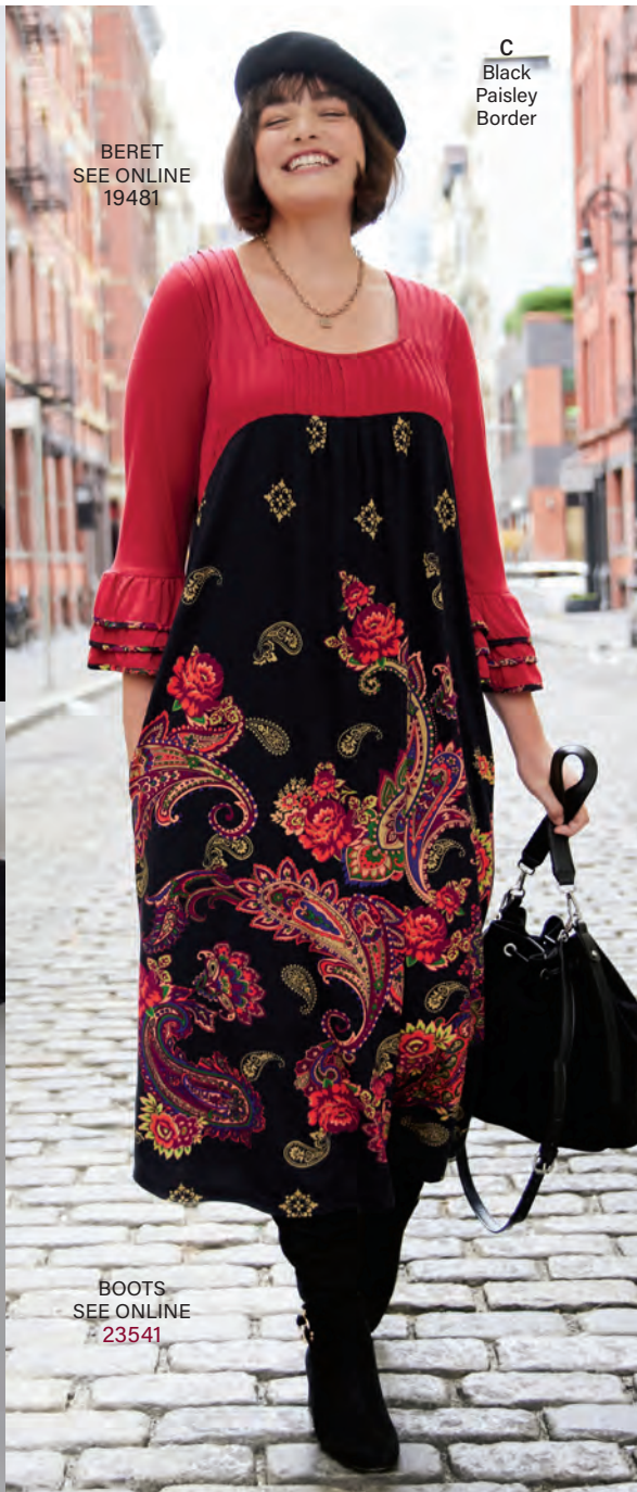
BERET SEE ONLINE 19481