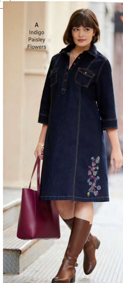
A Indigo Paisley Flowers