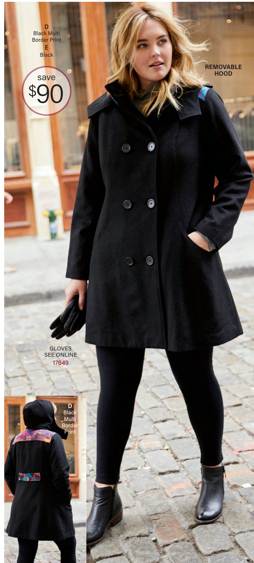
GLOVES SEE ONLINE 17649