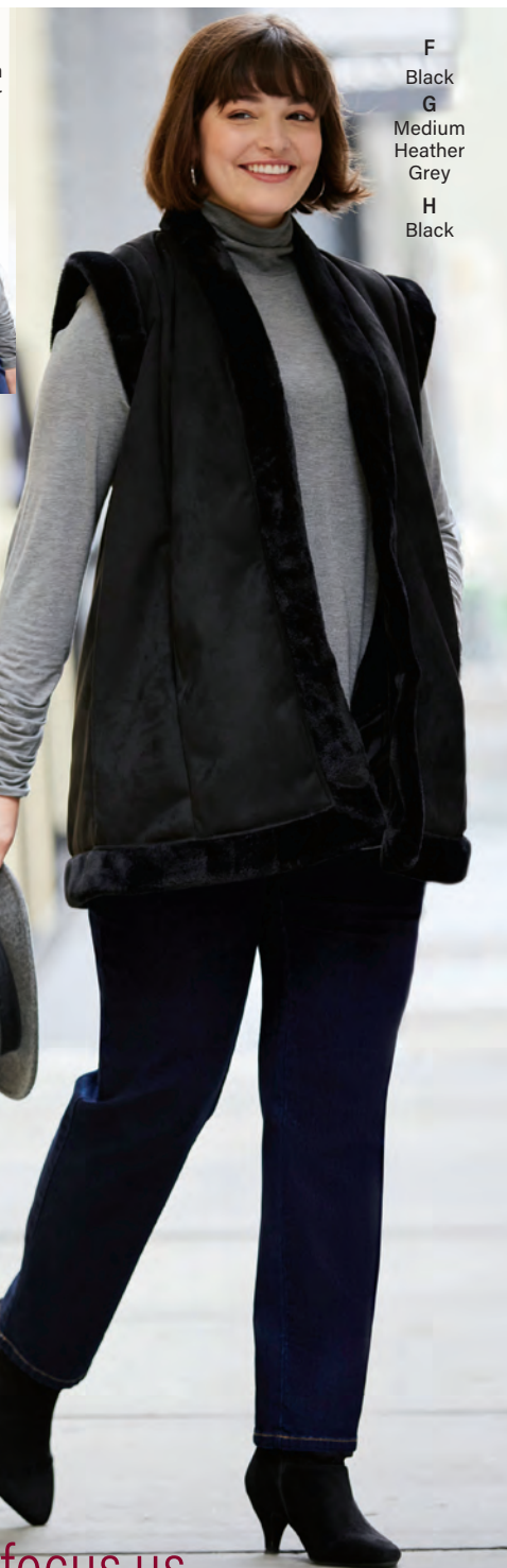
F Black G Medium Heather Grey H Black