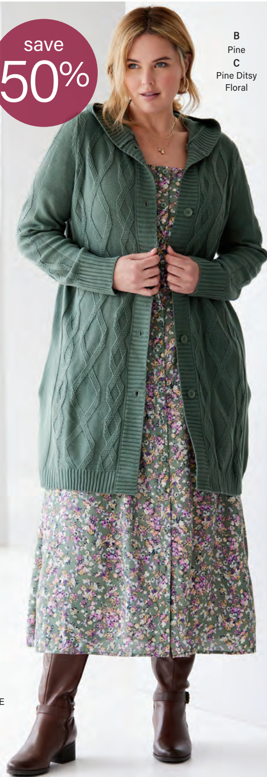
B Pine C Pine Ditsy Floral