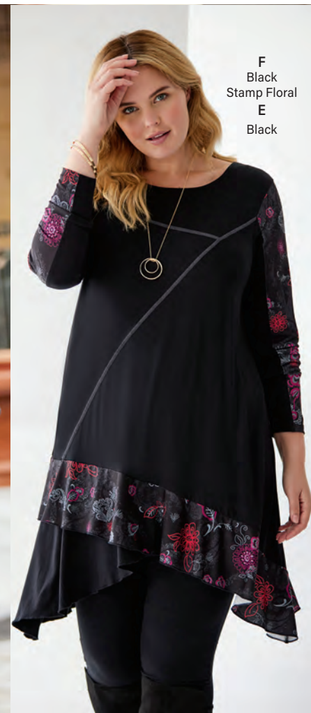
F Black Stamp Floral E Black