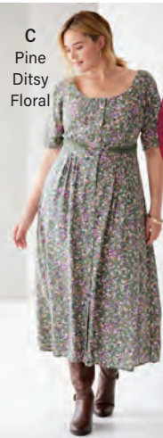
C Pine Ditsy Floral

totally unique go-to warbrobe staples that have that special something, just like you!