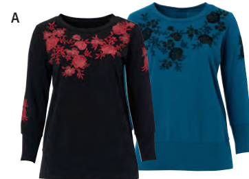
Black Rose Embroidery