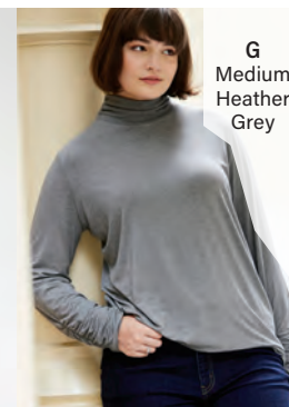
G Medium Heather Grey