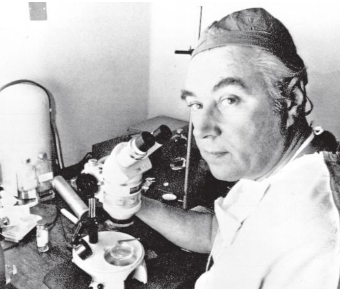
Consultant gynecologist Dr. Patrick Steptoe, one of the pioneers in the fertilization of human eggs to make a "test tube baby," works in his lab in 1970.

EGG RETRIEVAL Using ultrasound images as a guide, the health-care provider inserts a thin needle into the ovary and sacs containing the eggs. The needle is connected to a suction device, which pulls the eggs and fluid out of each follicle, one at a time. The procedure, called follicular aspiration, is then repeated for the other ovary.