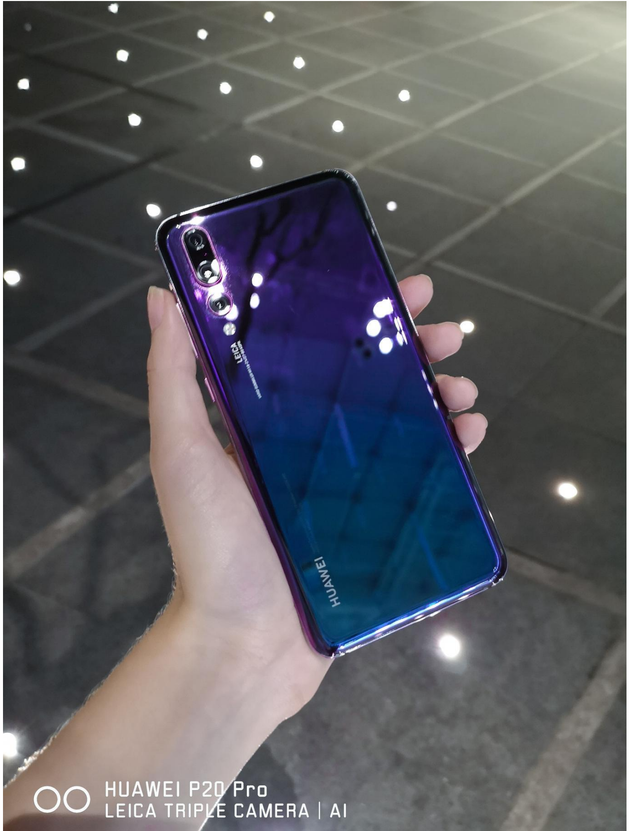
○○ HUAWEI P20 Pro LEICA TRIPLE CAMERA | AI