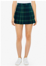
Plaid Tennis Skirt