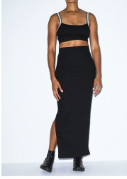
Thick Rib Maxi Skirt