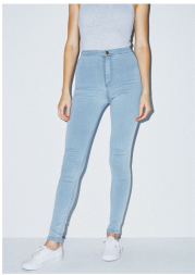
The Easy Jean