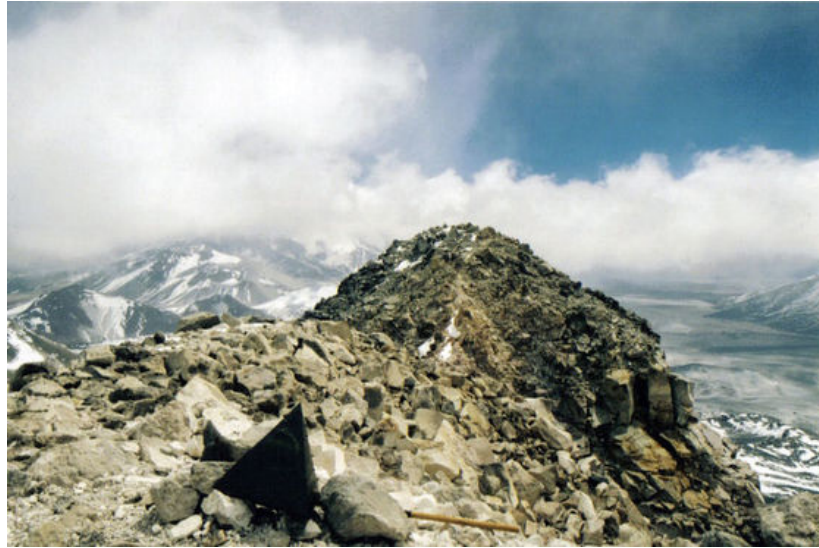
Ojos del Salado, Chile, the highest active volcano in the world