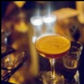
EXPERIMENTAL COCKTAIL CLUB