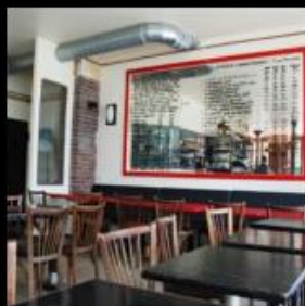
LES BANCS PUBLICS

Universally known for its passion for the grape, Paris is overflowing with traditional caves à vin and wine bars selling world-class French wine. The Parisian appetite for great beverages doesn't end there, though, as the city's growing love of craft beer, creamy lattes and classy cocktails proves. You'll find bartenders as well-versed in mixology as coffee art across the city's haunts. Don't forget to order a charcuterie board or cheese plate to soak it all up.