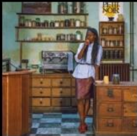
LE COMPTOIR GÉNÉRAL