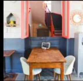
LE PAVILLON DES CANAUX