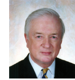
James B. Hunt, Jr. 詹姆斯·亨特 (919) 755-2105 jhunt@wcsr.com (Former North Carolina Governor) Federal & State Government Affairs, Economic Development