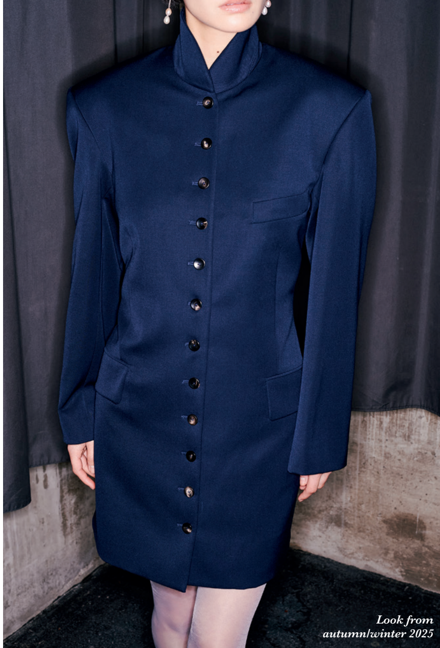
Look from autumn/winter 2025