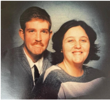
Image 6: Britt shared this photo of her beloved parents smiling together