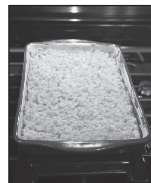
Mac-n-cheese is a Dillow family staple.