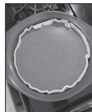
The star of the Thanksgiving dessert table.