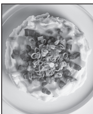
Add some bacon and you have delicious mashed potatoes.