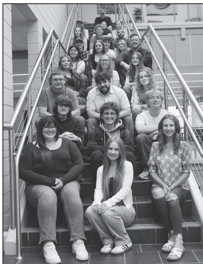
The Slate staff from the fall semester of 2025.