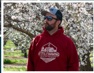
Pictured: Bryce's son inspecting the blooming almond trees.