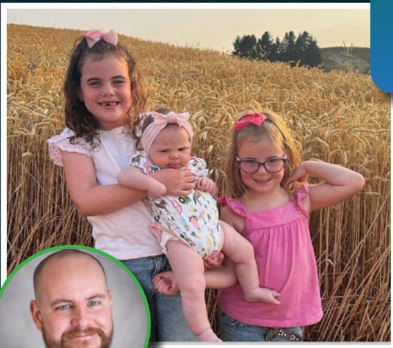
Pictured: Brent's daughters on the pages of Wheat Life Magazine.