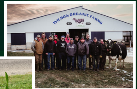
Pictured: The Wilson Organic Farms team.

From childhood summers to driving the combine today, wheat harvest on our Tipton, KS farm has always been a family affair.