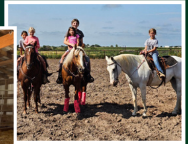
Pictured: Brenda's daughters riding horses with their cousins.