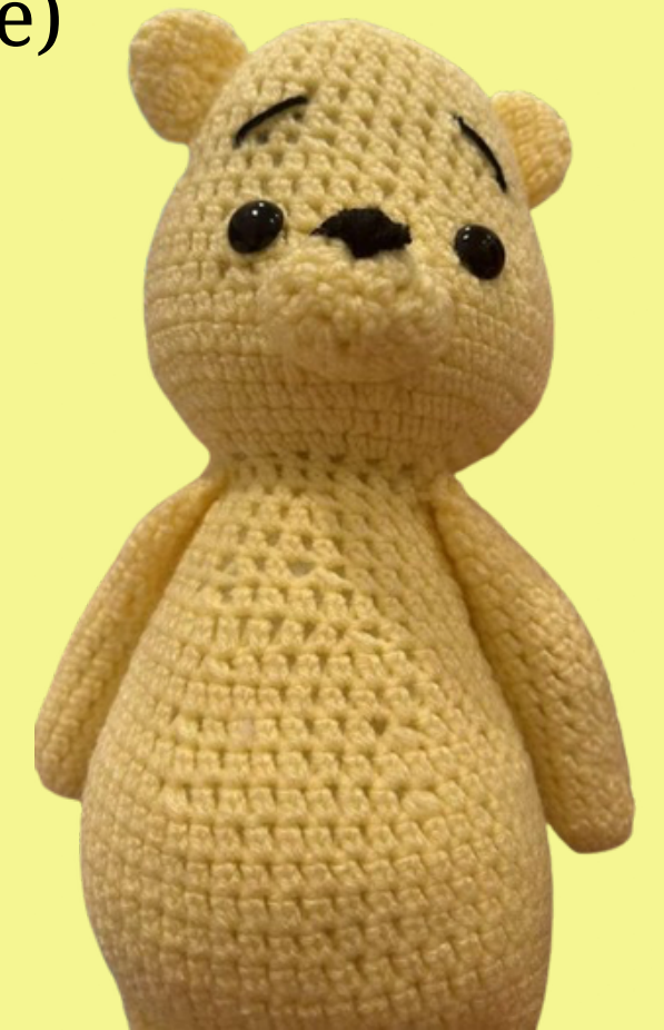
Crochet Winnie-the-Pooh from Crochet 4 A Cure