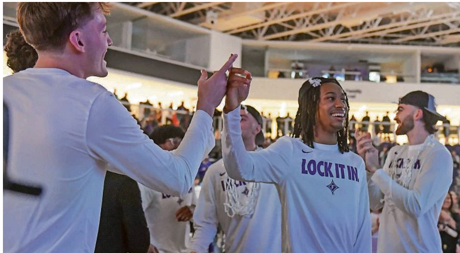
Furman players celebrate on March 15 during the watch party at Timmons Arena in Greenville.