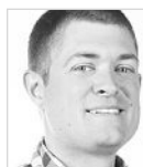
Blake Toppmeyer Columnist USA TODAY NETWORK

We really needed more proof, huh? Well, now we have it.