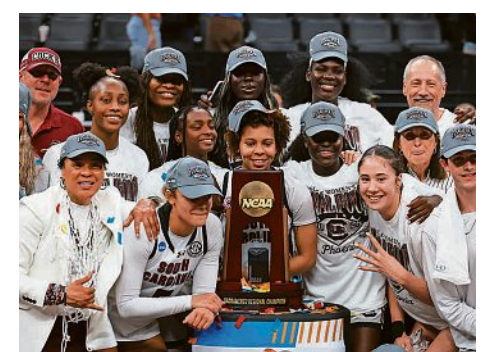
South Carolina celebrates after defeating TCU in the Elite Eight on March 30 in Sacramento, California.