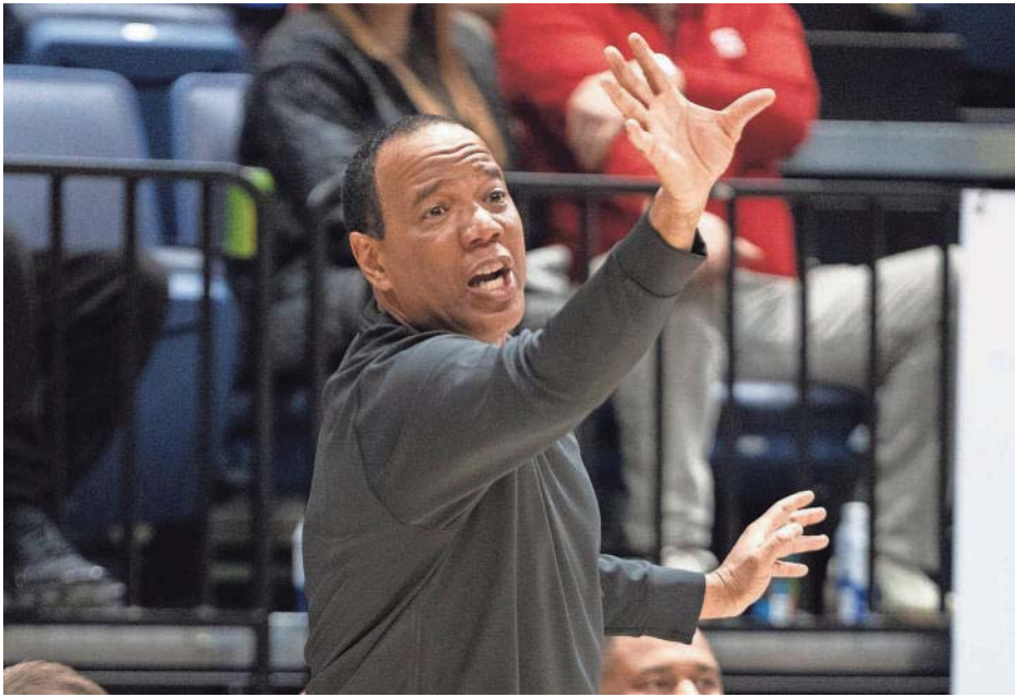
Kevin Keatts was fired after eight seasons coaching N.C. State.