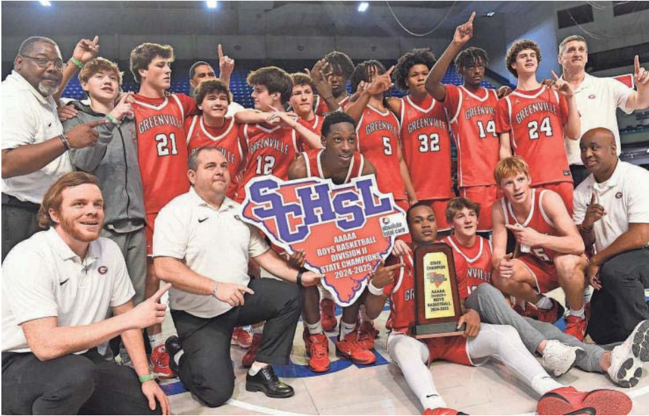
Greenville High School players and coaches celebrate their state championship on Saturday night in Florence.

Record: 21-10, Class AAA Previous ranking: 4 Last game: Lost to Keenan, 58-53, in