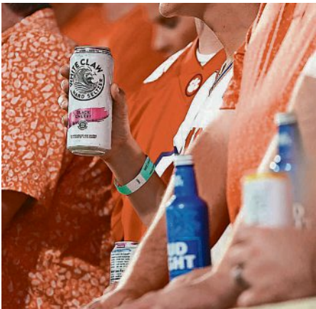
Clemson fans hold alcohol containers on Aug. 30 at Memorial Stadium.