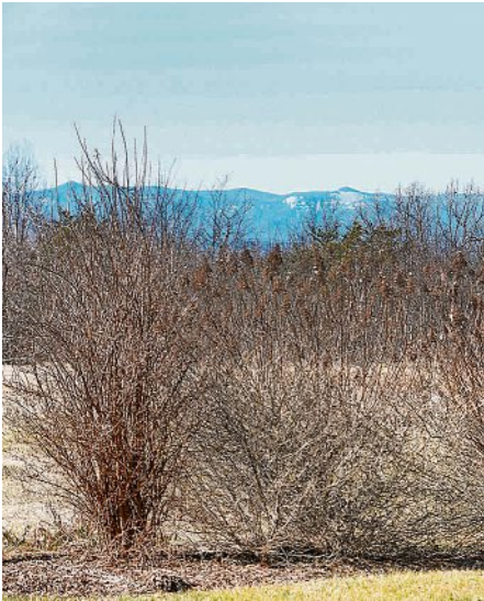
This is a view of the landscape near the top of Paris Mountain. A proposed hotel project is being discussed near this location.