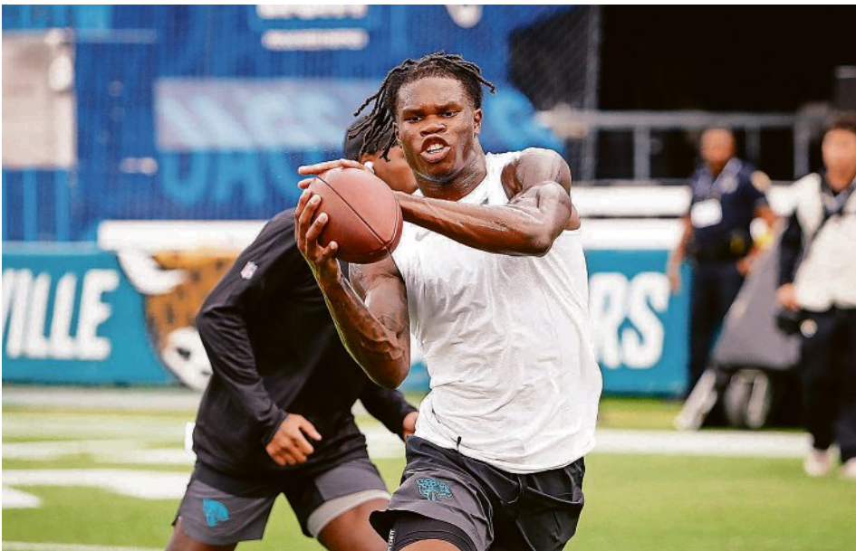
Jaguars wide receiver Travis Hunter warms up before a preseason game against the Pittsburgh Steelers on Aug. 9.

For the third time in five seasons, a new era begins for the Jacksonville Jaguars on Sunday when the team hosts the Carolina Panthers to kick off the 2025 campaign. Liam Coen makes his debut as the eighth full-time head coach in Jaguars history in the culmination of what has been a meteoric rise. He’s just two years removed from being offensive coordinator/quarterbacks coach at Kentucky in 2023, and was the offensive coordinator for the Tampa Bay Buccaneers in 2024. “I do have to take it in. It’s a cool moment for me personally and professionally,” Coen said of his debut. “You’re eager to go and try and put a product on the field that people are proud of.” Coen will be opposing the man he replaced in Tampa. Dave Canales, offensive coordinator for the Bucs in 2023,