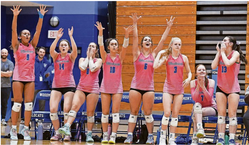
The Woodmont Wildcats celebrate during a match on Oct. 29.