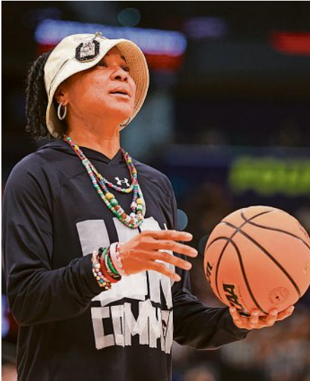
South Carolina coach Dawn Staley looks on during practice on April 5 in Tampa, FL.