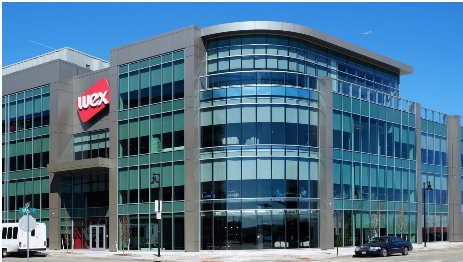
An exterior shot of WEX's global headquarters in Portland. The building's curved curtain-wall windows provide the offices abundant sunlight and views of Casco Bay.