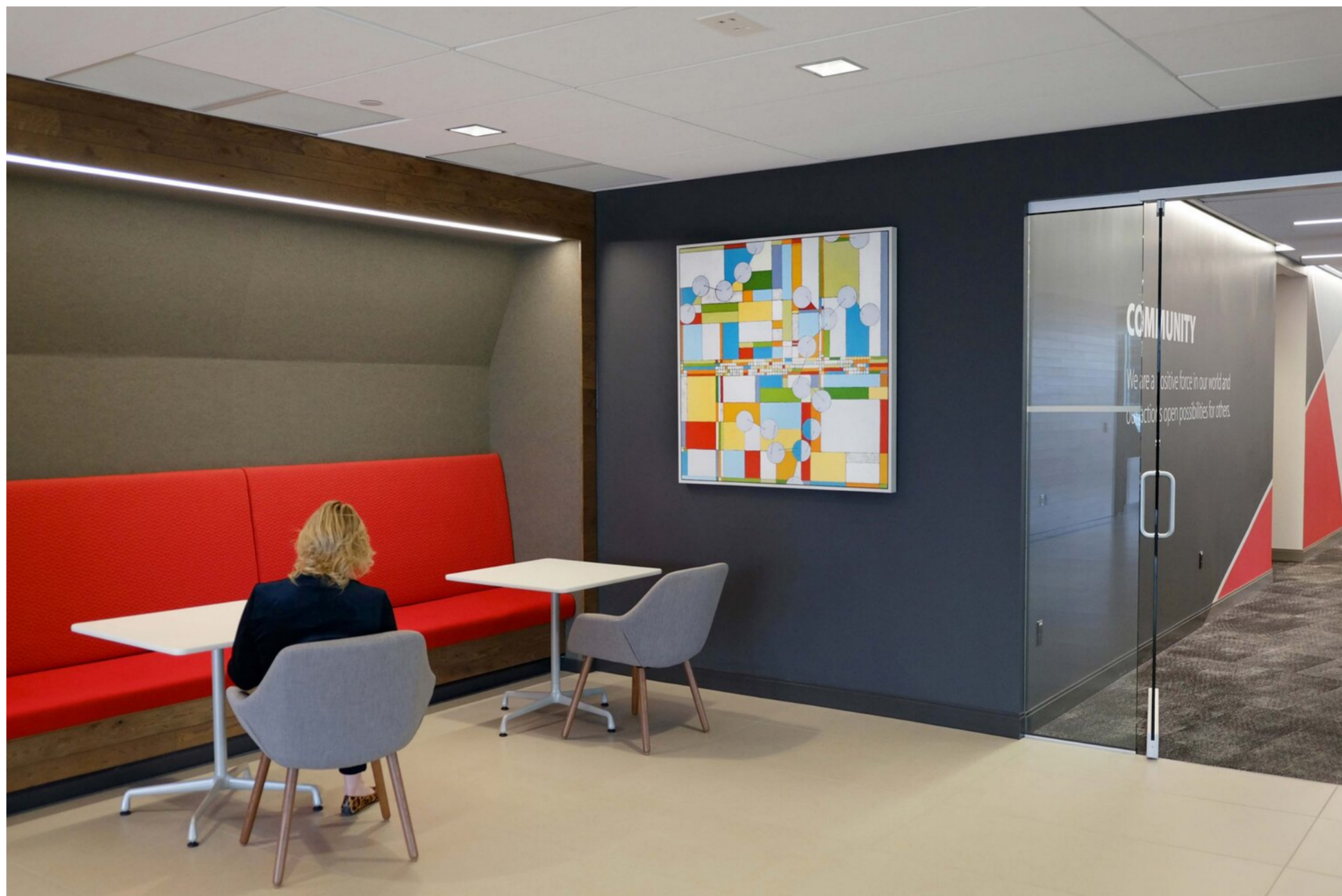
In a lobby alcove, Annie Darling’s abstract painting Ariel View , 36 by 36 inches, encaustic and oil on panel, includes bright, primary colors that highlight the company’s visual identity, particularly the pops of red that echo the company’s logo.

SMRT designed the interior using the WELL Building Standard, a rubric that focuses on the health and well-being of its occupants. Physical health is prioritized with an on-site gym, bicycle storage, and collaborative office spaces that encourage movement. Breakout rooms and a cafe offer space for deep concentration and socializing. Biophilic features such as indoor plants and a large saltwater fish tank reduce stress and bring the outdoors in, while a 20,000-square-foot rooftop deck offers access to fresh air and ocean views. Indeed, the global headquarters, now home to 400 employees, is state of the art, so it seems only right that it be filled with art of the state.