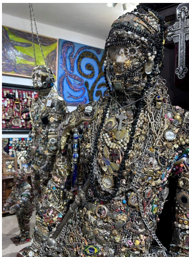
The relics hunters are glued with jewelry and clocks.

In the back of his little castle, Estevão built a room decorated with his own works. Paintings, sculptures, and assemblages made from repurposed materials are for sale to visitors starting at 50 reais.