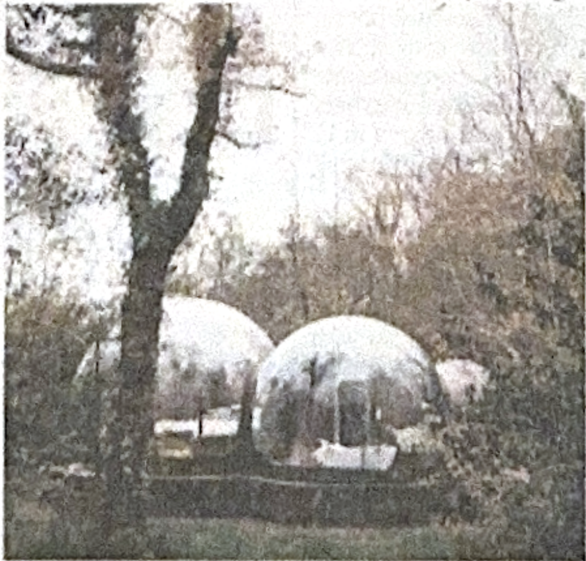
Finn Lough forest bubble dome

Me & Mrs Jones is an award winning boutique hotel located in Portstewart. The quirky, vibrant decor creates a sense of romance and luxury. Their rooms are filled with grandeur including their carved wooden beds dark, dark colours, and ceiling mirrors, you are in the perfect place for a romantic evening. Each room is unique with different colours and styles with their inspiration taken from top hotels around the world. You will not be disappointed with the food selection at this boutique hotel. From roasted monkfish to a supreme of free-range chicken, Me & Mrs Jones have a range of dishes on their menu to suit all tastes. They also have a great selection of drinks available, from craft beers as well as a range of lagers and beers from around the world, liqueurs, cocktails, spirits and both new and old world wines. Me & Mrs Jones have you covered when you are ready for an alcoholic beverage. Its location adds to the appeal, being situated on the main street of Portstewart you are just a short walk away from the Atlantic ocean. Northern Ireland Travel News are currently running a