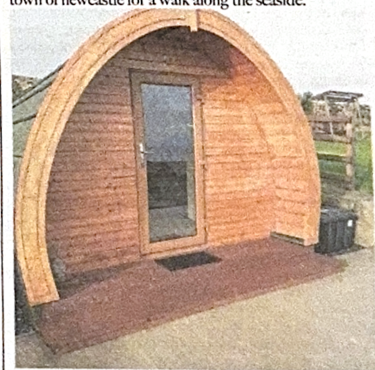
Carrickmore glamping pods

dining and travelling around. Relax in stylish and comfortable accommodation and dine in their exceptional restaurant as your special occasion deserves a special meal. The Burrendale hotel have held 'The Taste of Ulster Award' since 2012 with high quality local and seasonal food for their guests. Store your mind and body at the hotels luxurious spa that offers a variety of different treatments for you and your partner to enjoy. With eight individual suite they provide services such as a facial, massages, a nail bar for the perfect pampering session. At the Burrendale Hotel you will be able to relax in their cosy rooms but you can also take a trip into the busy town of Newcastle for a walk along the seaside.