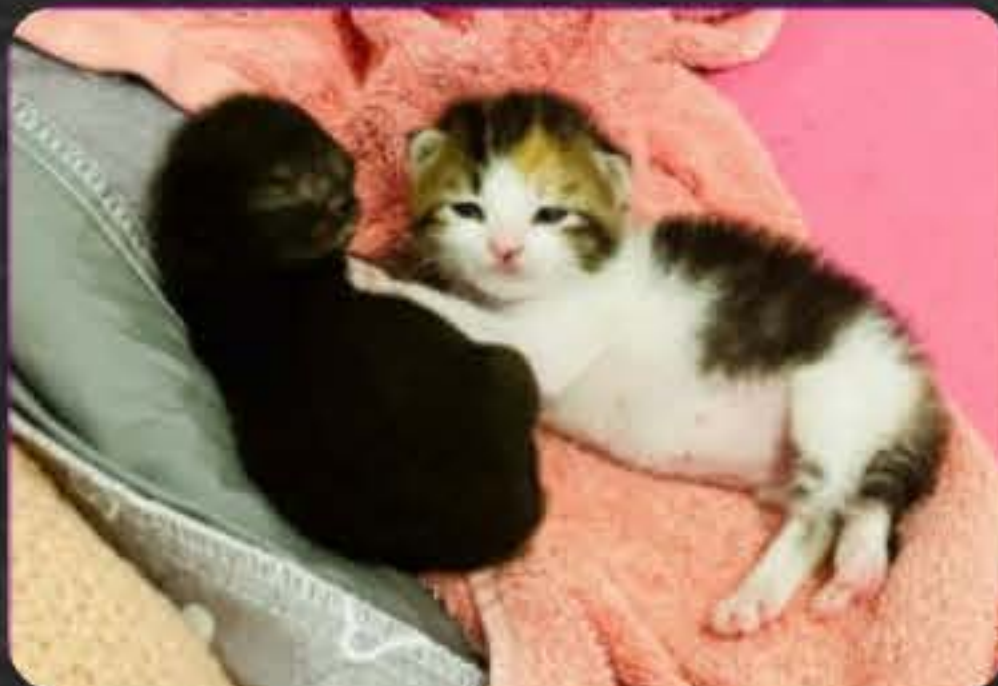
Clementine & Pearl