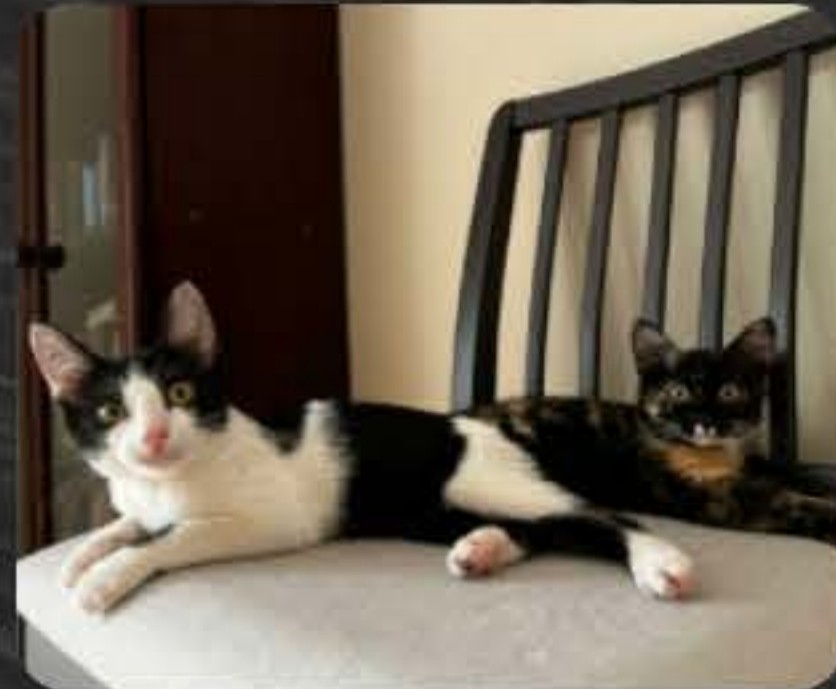
Pesto & Penne