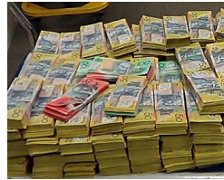
Homeowners Must Claim their $4271 Before End of... FetchRate