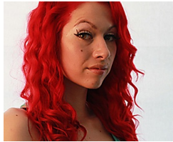
It's Scary What This Site Knows About TruthFinder