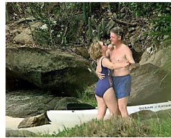
Super Rare Photos Of Hillary You've Gotta See Frank151