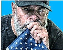
Not enough vets claim these amazing VA... LendingTree