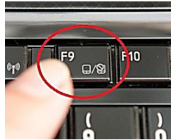
Don't Turn Off Your Computer Without Doing... Web Life Advice