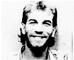
Florida Man's Mystery Disappearance... LifeDaily