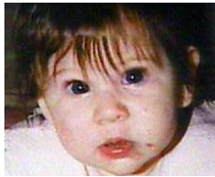
Baby Girl Vanishes From Crib. But 20... LifeDaily