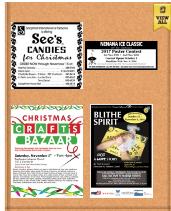
Local display advertising by PaperG