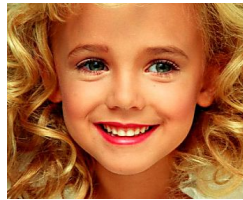
New Evidence In 20-Year-Old Case Leaves Police... LifeDaily