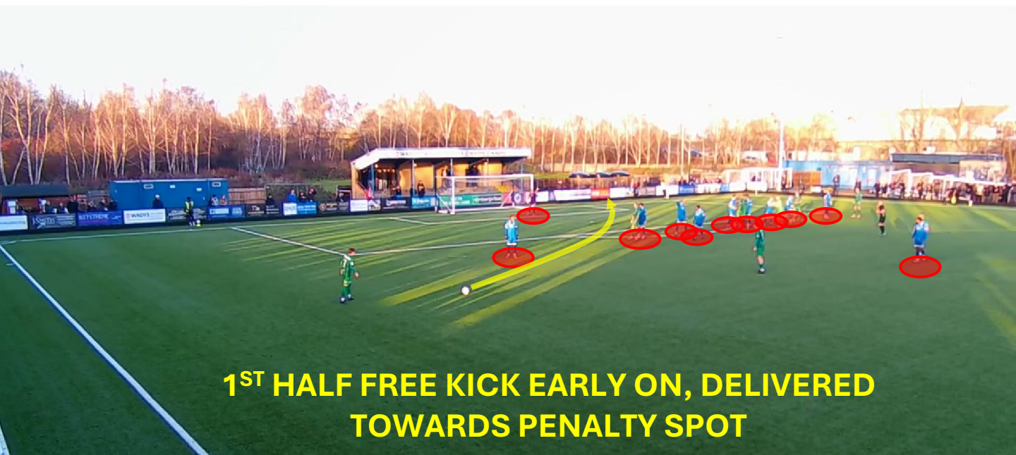
1 ST HALF FREE KICK EARLY ON, DELIVERED TOWARDS PENALTY SPOT