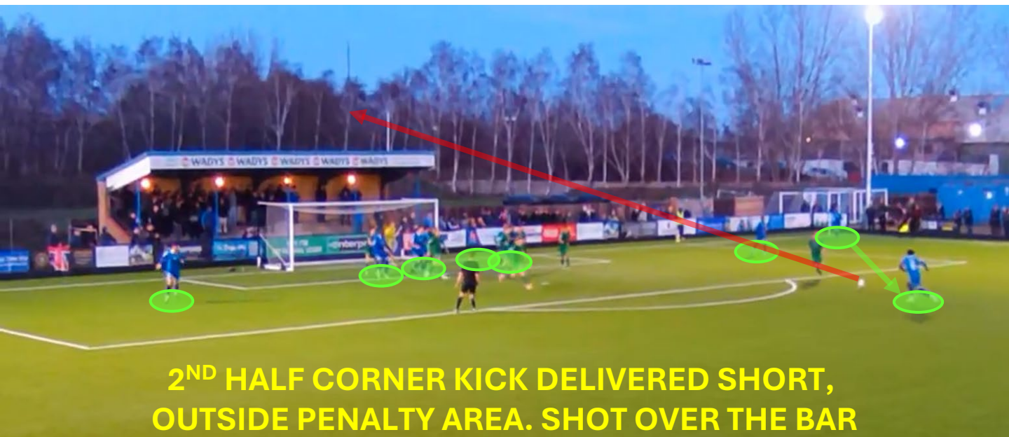
2 ND HALF CORNER KICK DELIVERED SHORT, OUTSIDE PENALTY AREA. SHOT OVER THE BAR