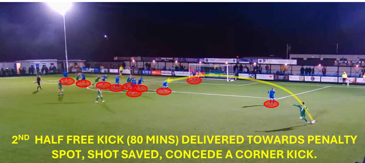
2 ND HALF FREE KICK (80 MINS) DELIVERED TOWARDS PENALTY SPOT, SHOT SAVED, CONCEDE A CORNER KICK.