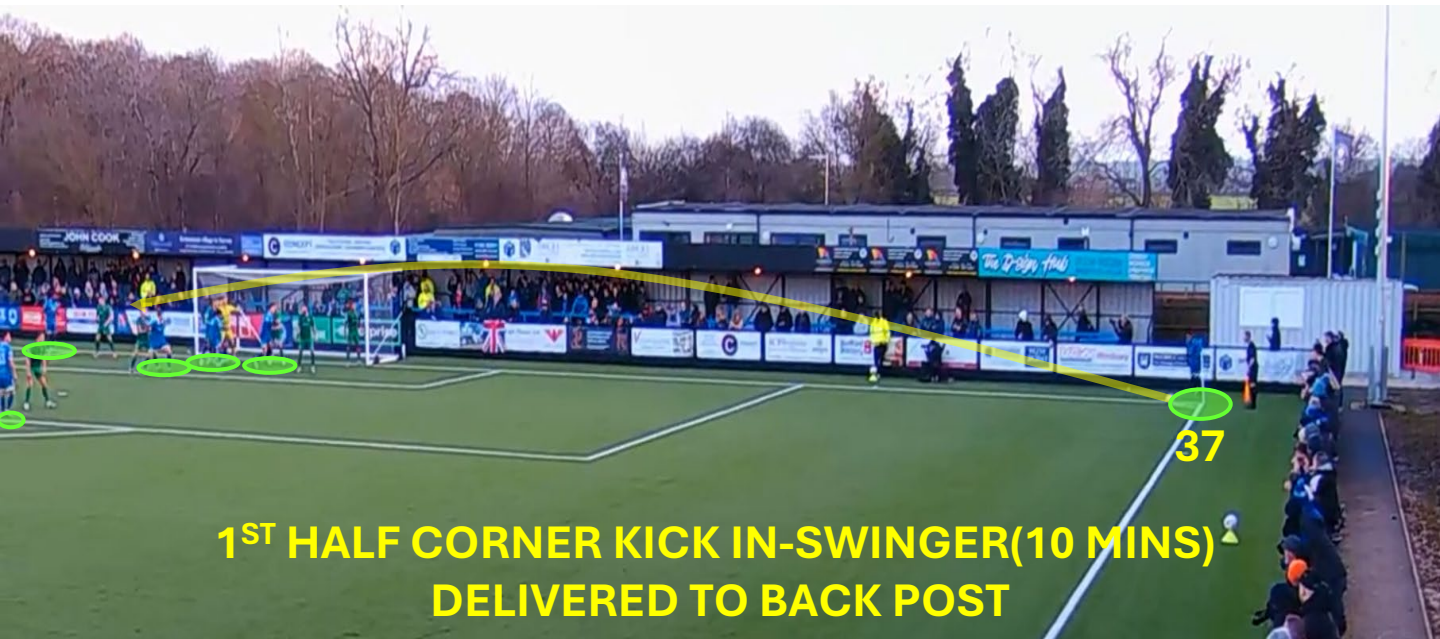
1 ST HALF CORNER KICK IN-SWINGER(10 MINS) DELIVERED TO BACK POST