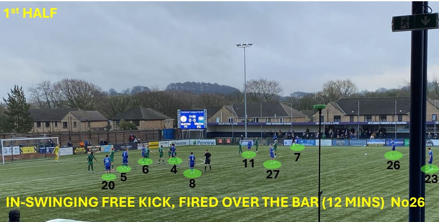
IN-SWINGING FREE KICK, FIRED OVER THE BAR (12 MINS) No26