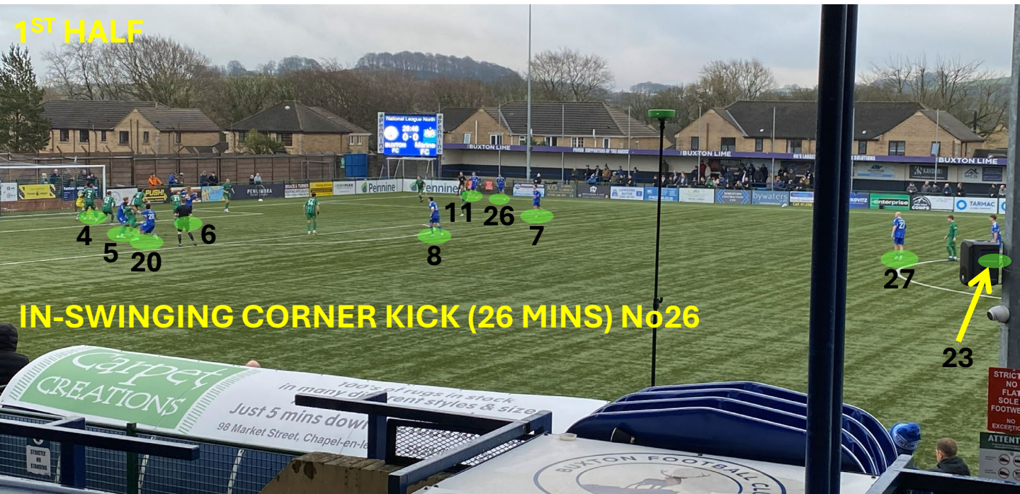
IN-SWINGING CORNER KICK (26 MINS) No26