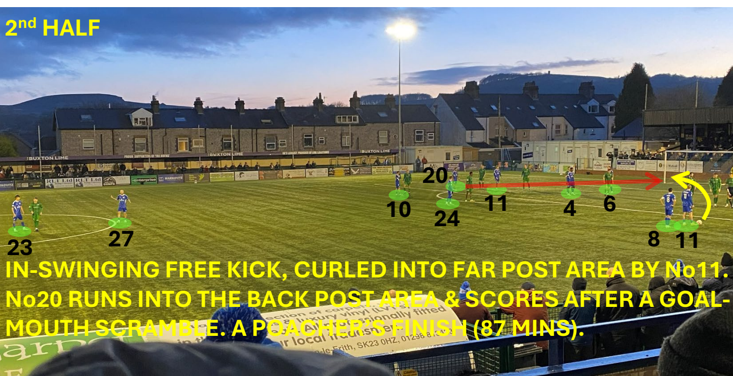
IN-SWINGING FREE KICK, CURLED INTO FAR POST AREA BY No11. No20 RUNS INTO THE BACK POST AREA & SCORES AFTER A GOALMOUTH SCRAMBLE. A POACHER'S FINISH (87 MINS).