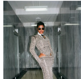
Teyana Taylor's Hips Made a Met Gala Statement

Heading H1: Our Expert Fashion Models Squad!