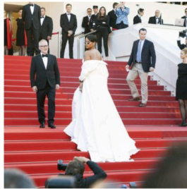
The 16 Best Cannes Dresses of All Time