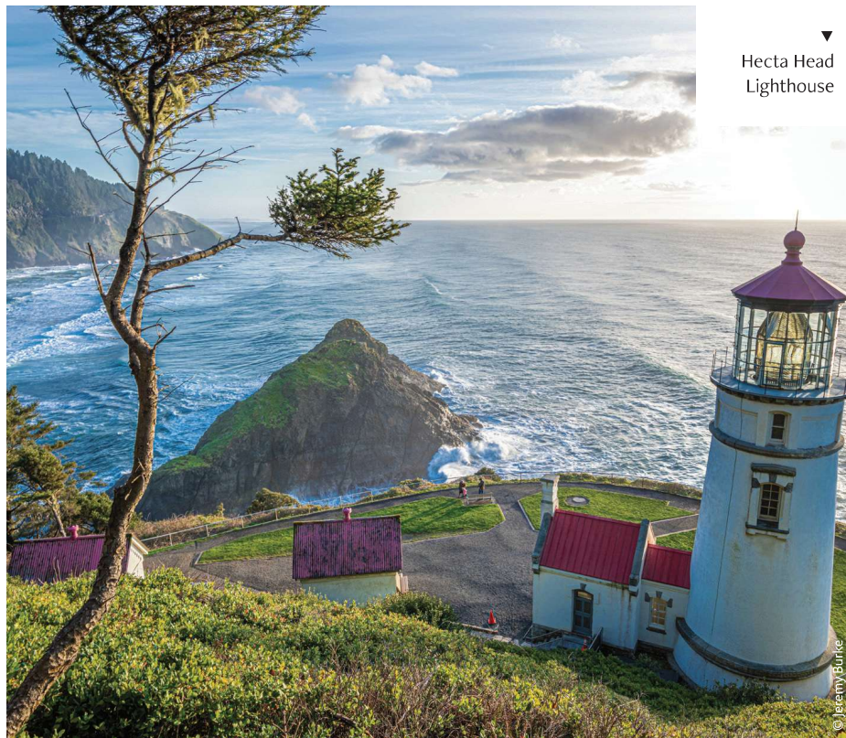
Heceta Head Lighthouse

If communing with nature is your style, Cape Perpetua Campground and the Carl G. Washburn Memorial State Park campground offer great camping options near Yachats, with plenty of trails leading to more must-see spots along the coast.