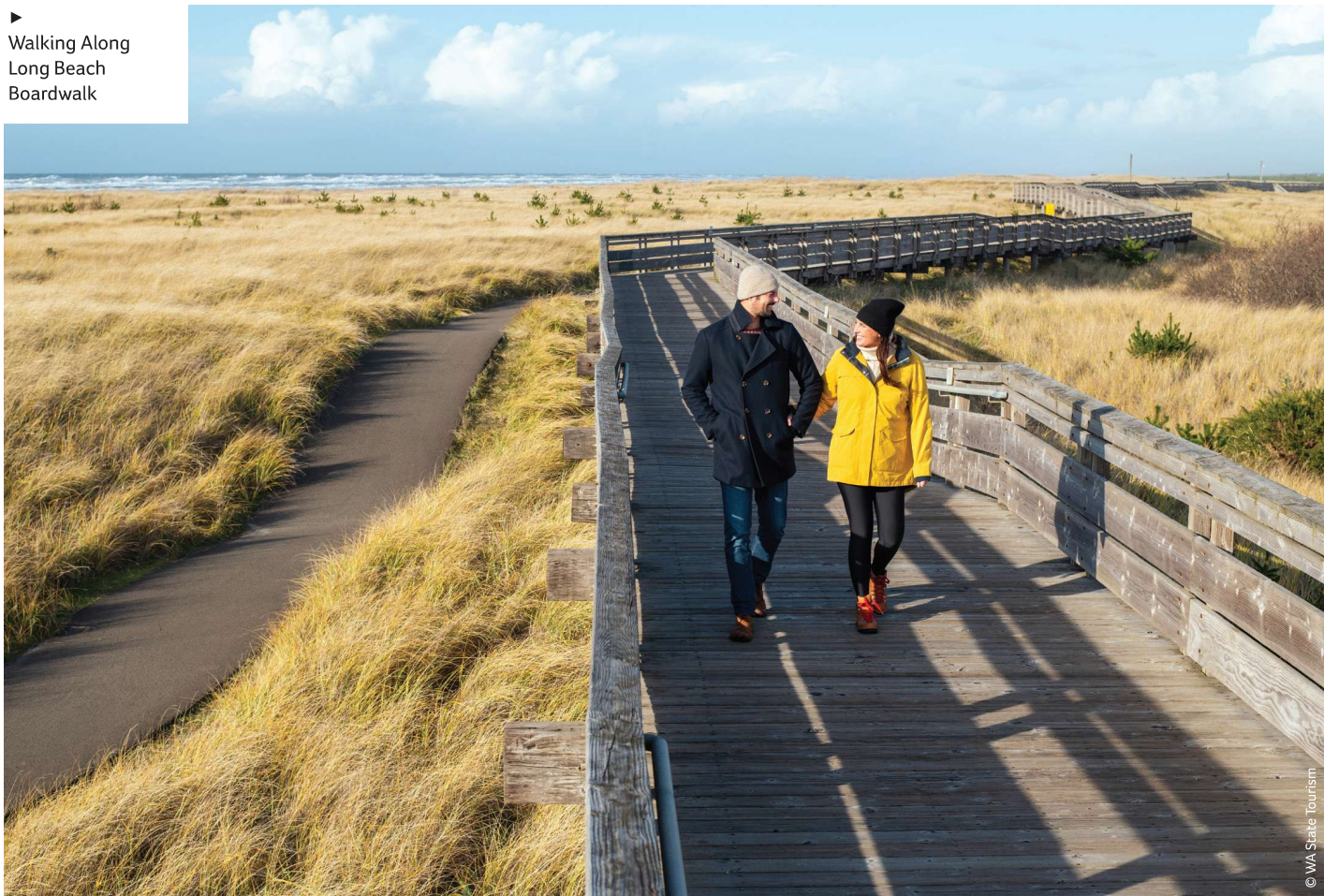
▶ Walking Along Long Beach Boardwalk