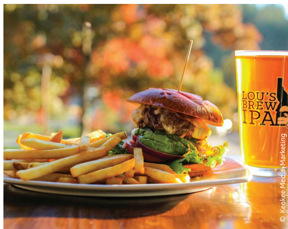
▼ Buger and Beer from Lou's Brews