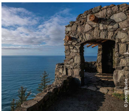
▲ Viewpoint at Cape Perpetua