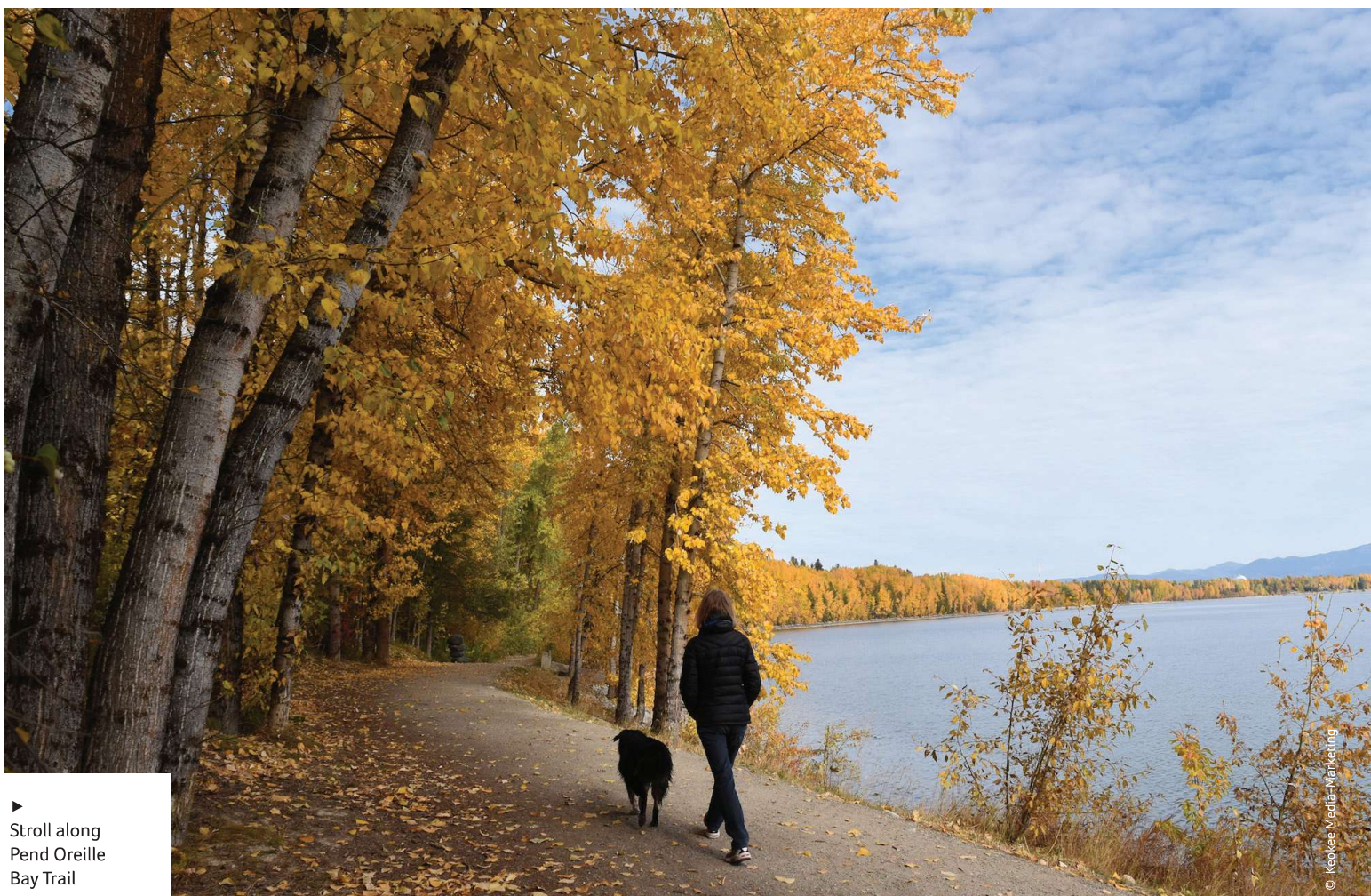
▶ Stroll along Pend Oreille Bay Trail