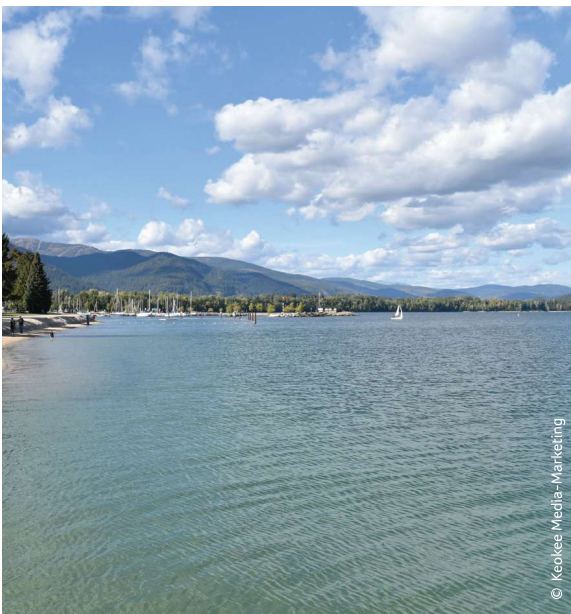
◀ Sandpoint City Beach