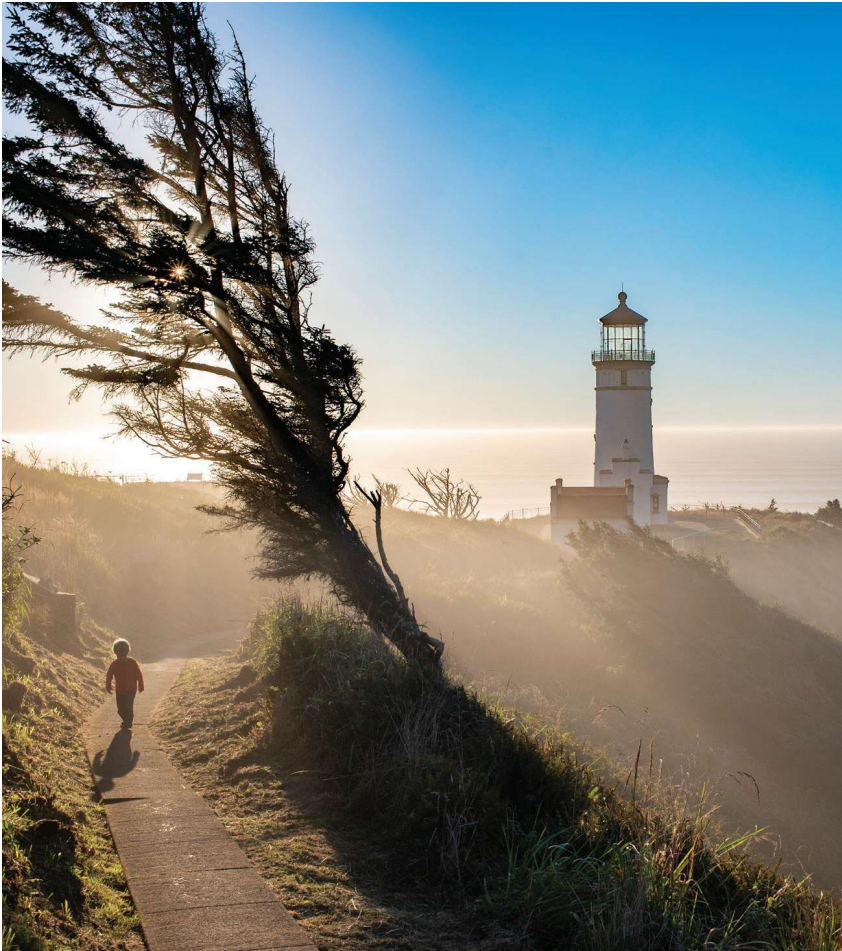
◀ Trail to North Head Lighthouse

the treacherous mouth of the Columbia River. Cape Disappointment offers over 100 standard campsites along the water, making crashing waves the soundtrack to your trip. Off-season camping at Cape Disappointment is much easier to book because of lower demand, so you save both money and stress!