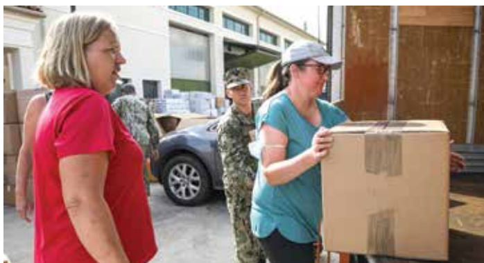
NMCRS Sigonella volunteers unloading donated items in support of Operation Allies Refuge at Naval Air Station Sigonella.

NMCRS can “be there” for moments like this, because of donors like you. Your generous giving allows us to give back in ways and experiences that are truly priceless.