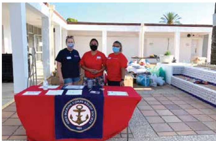
NMCRS Rota volunteers at the reception table assisting with sign-ups and check-ins for volunteers, and with donation drop-offs for donors.