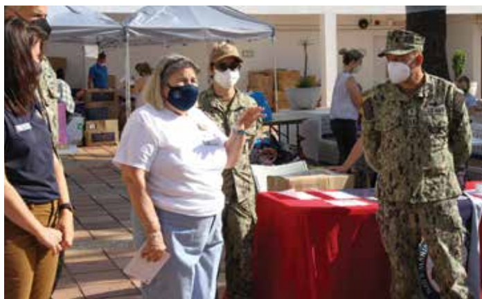
NMCRS Rota staff members briefing reporters on the volunteer efforts during a community donation drive.