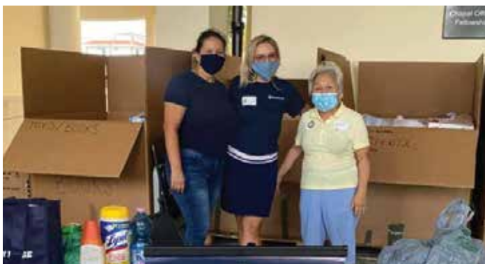
NMCRS Naples volunteers serving at the donation processing center, a place set up to greet donors as well as the staging area for packing the donations.