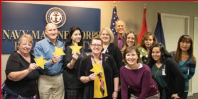
Staff at NMCRS HQ celebrates Charity Navigator rating

NMCRS is proud to announce that its strong financial health and ongoing accountability and transparency has earned a Four-Star Rating from Charity Navigator. Thank you to our staff and donors who have helped make this possible!