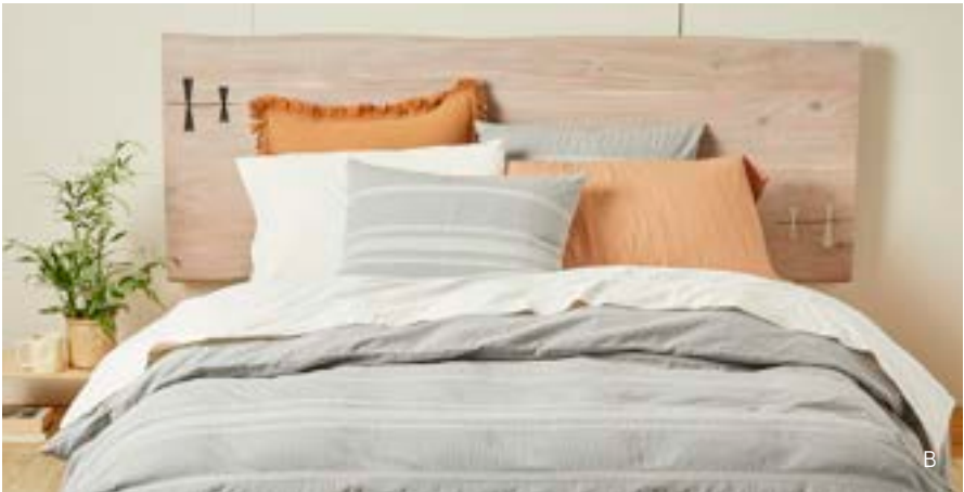
Morelia: Plays with pattern, texture and yarn-dyed color in prewashed organic cotton with a gently crinkled finish.