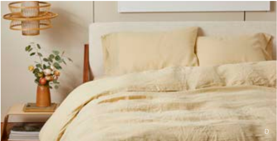
Rippled Stripe: Yarn-dyed stripes and puckered texture capture our coastal inspiration in prewashed organic cotton.

A. Lost Coast Organic Duvet Cover $348–$398, B. Morelia Organic Duvet Cover $348–$398, C. Indio Textured Grid Organic Duvet Cover $278–$328, D. Rippled Stripe Organic Duvet Cover $298–$348