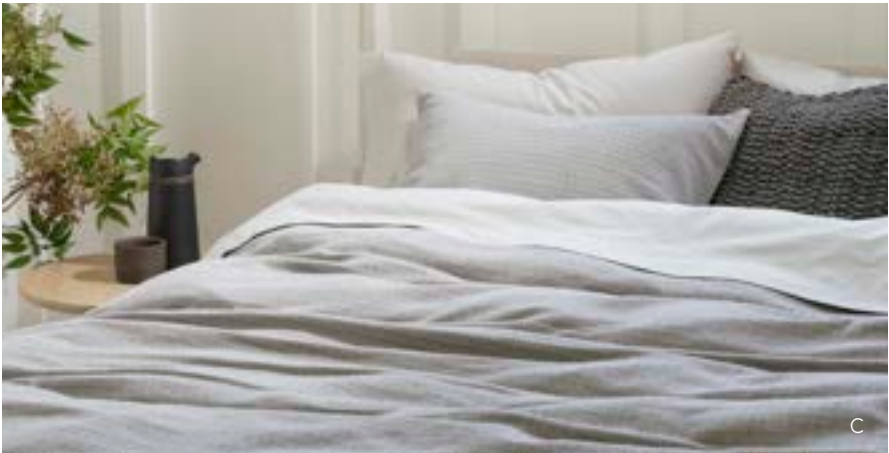
Indio: Relaxed elegance that's all in the texture, with a raised grid woven into soft-washed organic cotton twill.