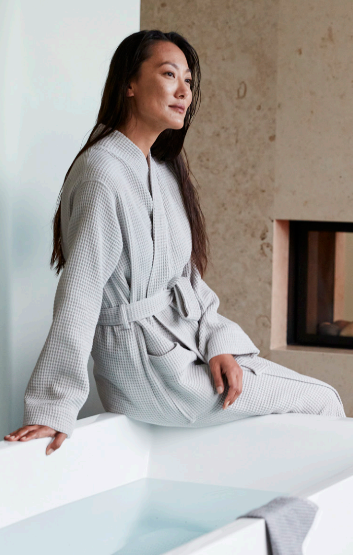
→ Unisex Mediterranean Organic Modern Robe $188 Unisex Cloud Loom™ Organic Robe $148 Unisex Air Weight® Organic Robe $128