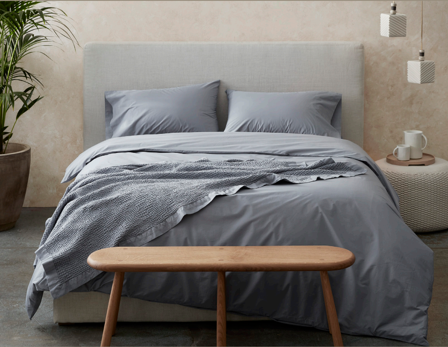
300 Thread Count Organic Percale Sheets (Steel Blue) $198–$258 Reyes Organic Waffle Throw $148

in the world for environmental and social welfare. This choice benefits the entire supply chain, while creating the perfect sheets for a smooth and breathable bed. 300 TC Percale creates better air flow to keep you cool on warm nights—and stands up to years of washing.