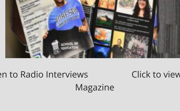
Click to play Discover TV Series