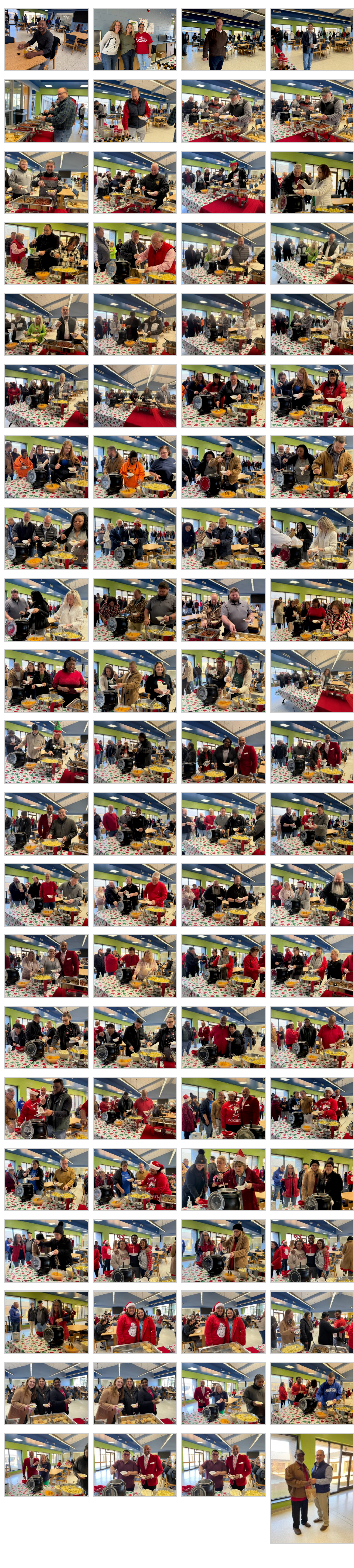
Published on December 13, 2024 by Cheryl Hemric NEWS