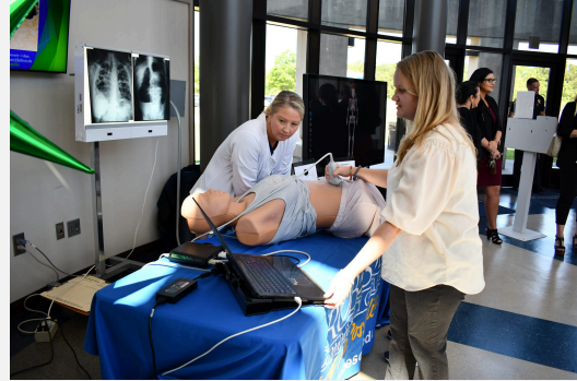
More than 50 employees were highlighted during the luncheon who "came back home" to work at RCC after graduating from the institution.