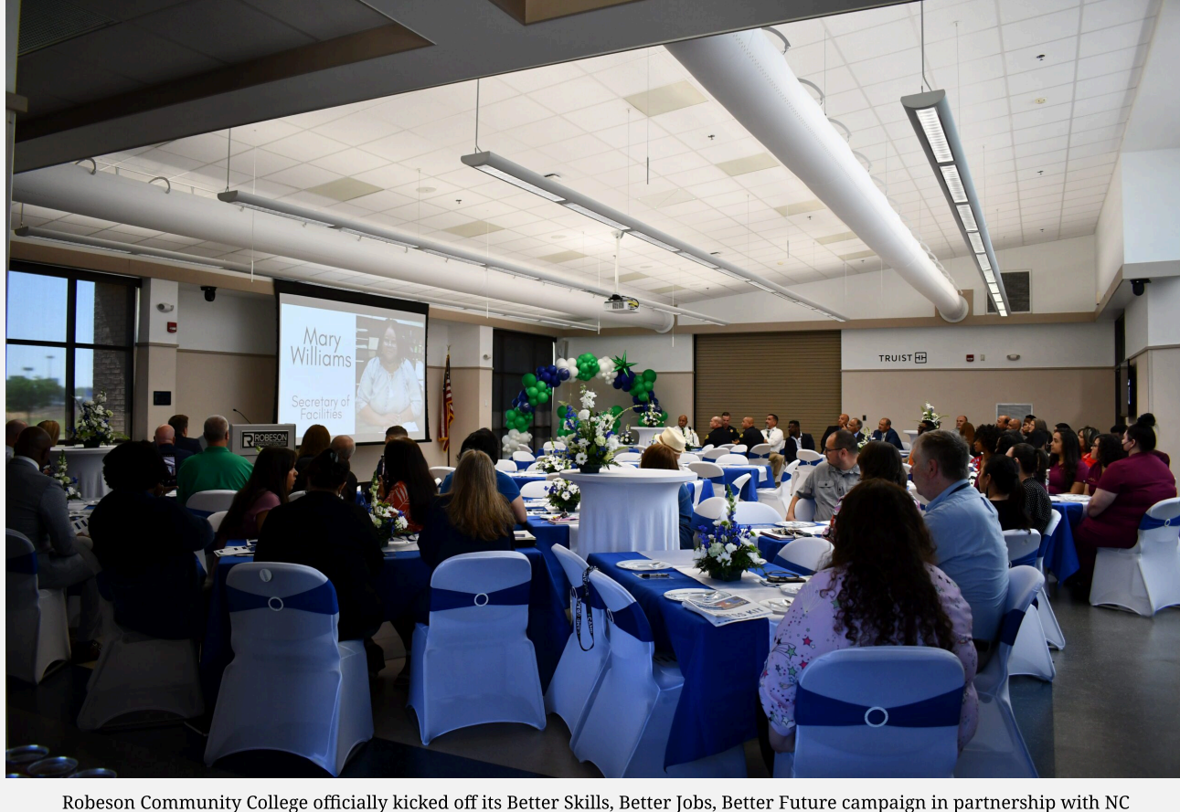
Robeson Community College officially kicked off its Better Skills, Better Jobs, Better Future campaign in partnership with NC Reconnect and the John M. Belk Endowment during a launch party held on Thursday.

Robeson Community College officially kicked off its Better Skills, Better Jobs, Better Future campaign in partnership with NC Reconnect and the John M. Belk Endowment during a launch party held on Thursday. The theme was reconnecting adult learners and getting them back in the classroom to complete a degree or post-secondary credential.